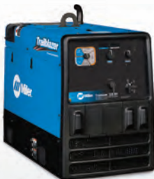
Trailblazer® 325 EFI