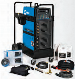
Dynasty® 350 Water-Cooled Package