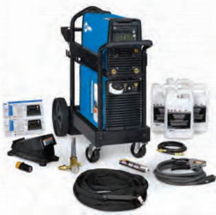
Dynasty® 280 DX Complete Wireless Package

Pairing various Weldcraft water-cooled torches with these select Miller power source packages is ideal for optimal welding performance.